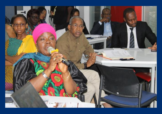
Participants at the AGOA conference in Abidjan, Cote d'Ivoire

The Trade Hub is working to increase the value of regional and international exports, particularly to the U.S. through the <u>African</u> <u>Growth and Opportunity Act (AGOA)</u>. In order to inform businesses about the Trade Hub's Co-investment Fund and the U.S. market access and requirement for food and textiles, the PPP Director and AGOA specialist for Trade Hub held a workshop for business owners in Abidjan, Cote d'Ivoire. Similar workshops will be organized in other parts of the region.